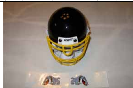
Miniature Helmets with Decals $30