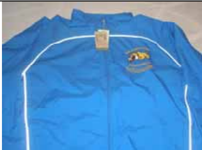
Lightweight Jacket S-5XL $70