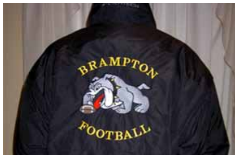
3-in-1 Stormtech Fleece Lined Jacket (S-XL)-$200 / (2XL)-$215 / (3XL+)-$225