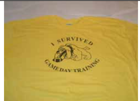
"I Survived" T-Shirt $10