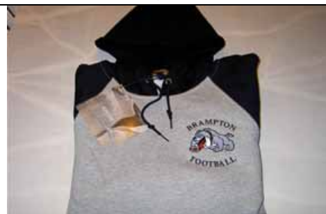
Hoodies (Black and Grey) (S-XL)-$65 / (2XL)-$67 / (3XL+)-$69