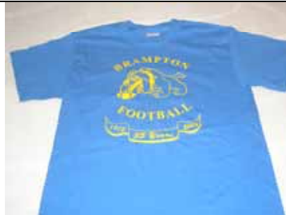
Anniversary T-Shirt S-XL $10 / XXL $14