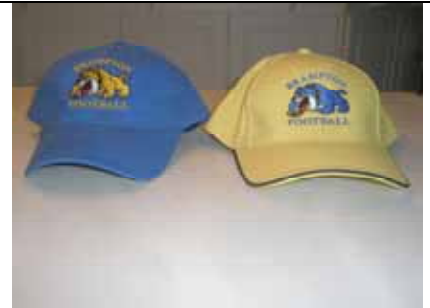
Anniversary Caps (Blue or Gold) $25