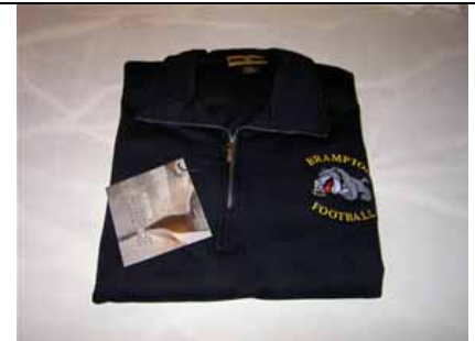
Sweatshirt with Quarter Zipper Black (S-XL) $55 / (2XL) $57 / (3XL+) $59