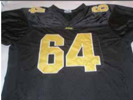
Game Worn Bulldog Stitched Jersey (Black or Gold) 1 for $15 / 2 for $25