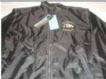
Viper Jacket S-5XI $50