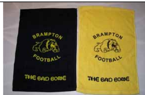
Bad Bone Towels (Black or Gold) $10