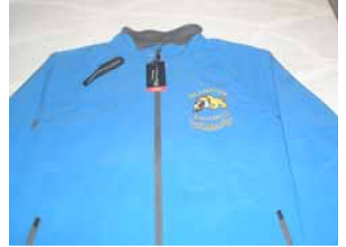
3 Layer Weathertech Jacket (S-3XL) $80