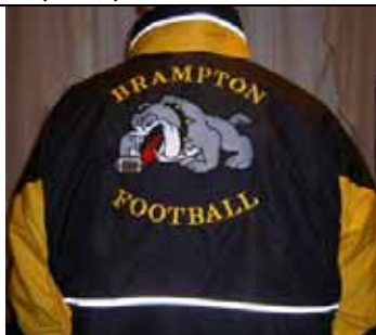
Microfiber Black and Gold Jacket (S-XL)-$100 / (2XL)-$115 / (3XL+)-$125