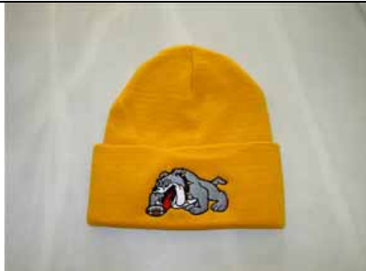
Toques - Various Styles Start from $14