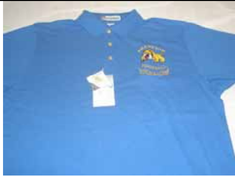
Golf Shirt S-5XL $40