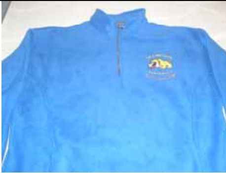
Solid Fleece Half Zipper XS-XL $55 / XXL $57 XXXL+ $59