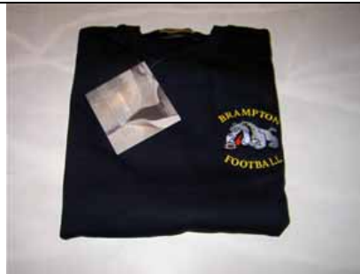
Sweatshirts Black (S-XL) $45 / (2XL) $47 / (3XL+) $49