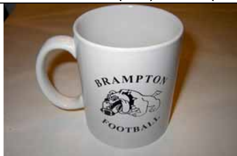
Coffee Mugs $5