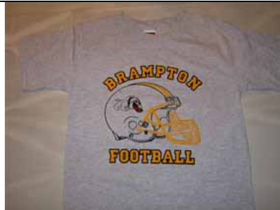
T-Shirts (Youth S - Adult 3XL) $10