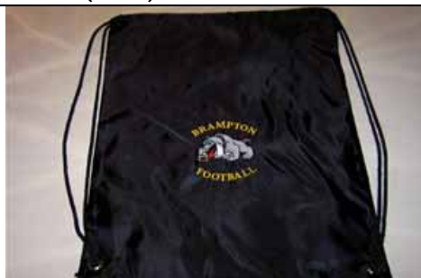
Drawstring Knapsack $15