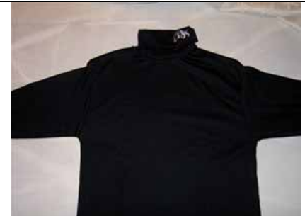
Turtlenecks - Black $25