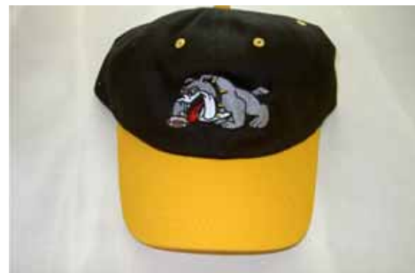
Caps (Various Styles) $20