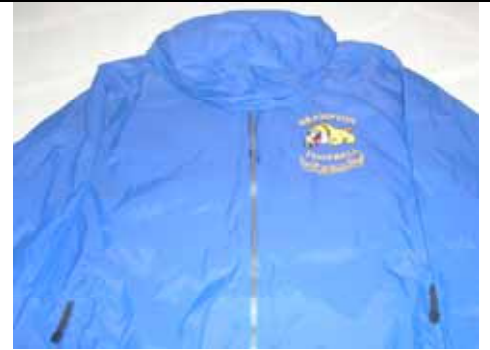
Nylon Hooded Jacket (S-5XL) Chest Logo Only $60 Chest and Back Logo $100