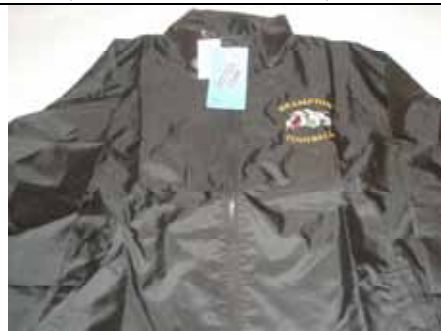
Shell Jacket - Black S-XXXL $30