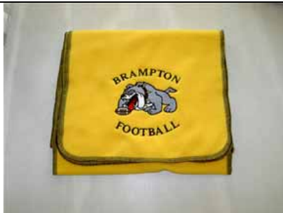
Scarves (Black or Gold) - Gold Shown $20