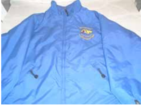
Insulated Mid Length Jacket (XS-5XL) Chest Logo Only $100 / Chest and Back Logo $150